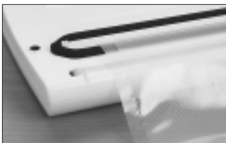
Place Bag in Vacuum Channel