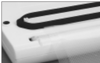
Place Bag on Sealing Strip