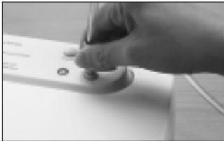
Insert Accessory Hose