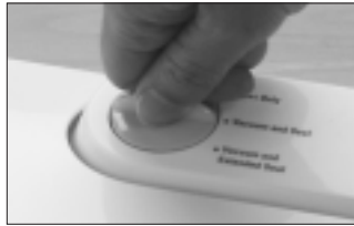
Set Seal Control Switch