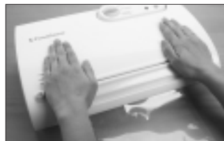
Press and Release Lid