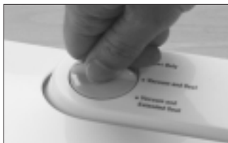
Set Seal Control Switch