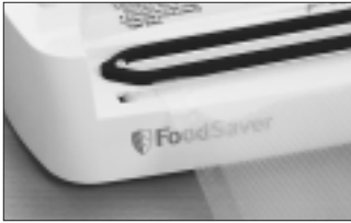
Place Bag on Sealing Strip