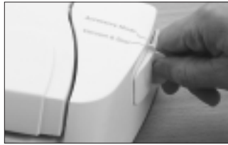
Set Vacuum Mode Switch