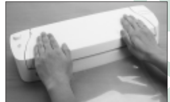
Press and Release Lid