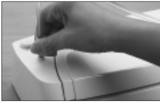
Insert Accessory Hose