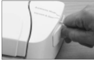
Set Vacuum Mode Switch