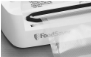
Place Bag in Vacuum Channel