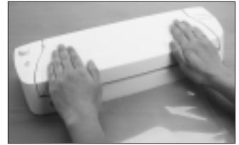
Press and Release Lid