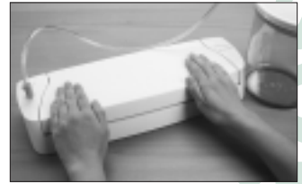
Press and Release Lid