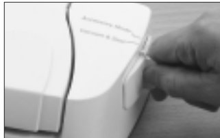
Set Vacuum Mode Switch